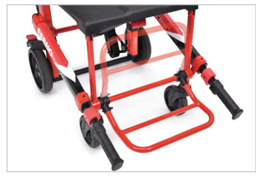
Extending footrest provides added support and comfort for patients.