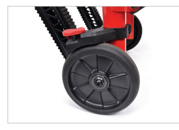
EZ GLIDE® technology provide a comfortable ride on almost any surface with 60% less shock than competitive stair chairs.